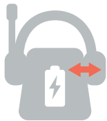
Data exchanged over the charging interface