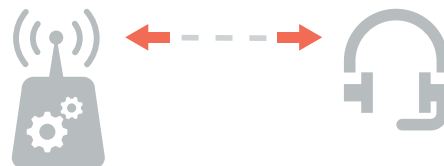
Data exchanged 'over the air'