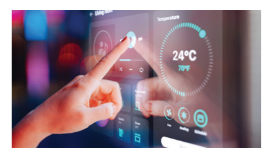
The number of IoT devices is forecasted to almost triple from 8.7 billion in 2020 to more than 25.4 billion worldwide by 2030.<sup>3</sup>