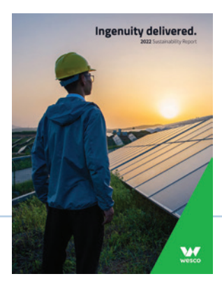
View our 2022 Sustainability Report