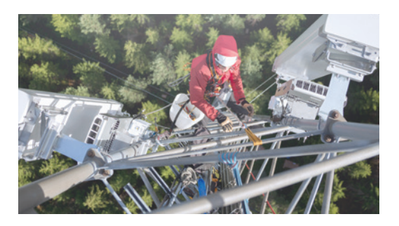
An estimated $3.5 trillion will be invested in infrastructure over the next five years to deliver 5G technology for the connected world.<sup>2</sup>