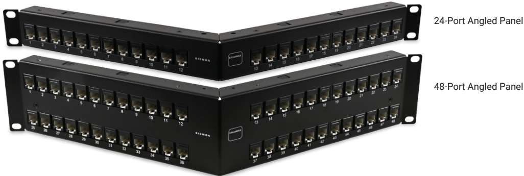
24-Port Angled Panel

The Siemon UltraMAX copper connectivity system utilizes a single platform of innovative patch panels for your category 5e, 6 and 6A UTP requirements. The UltraMAX panels have been designed with our users in mind, maximizing functionality, aesthetics and industry-leading performance into a format that will allow you to configure your ideal system.