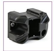
Palm Guard Insert