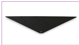
Angled Panel Cover