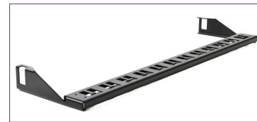
Rear Cable Manager