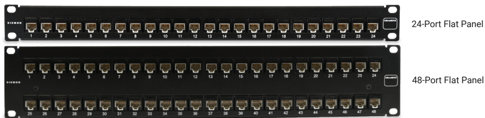
24-Port Flat Panel