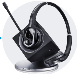
DW PRO 2