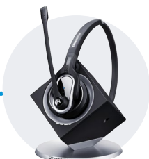
DW Pro 1