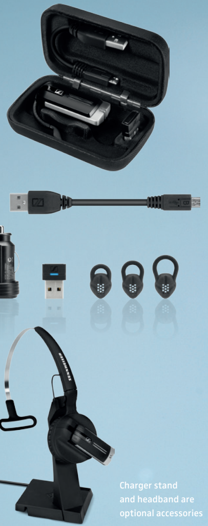
Charger stand and headband are optional accessories