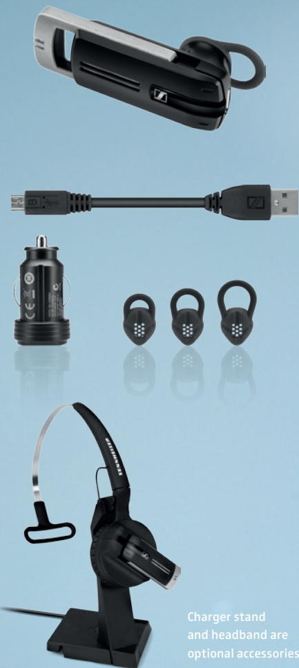
Charger stand and headband are optional accessories