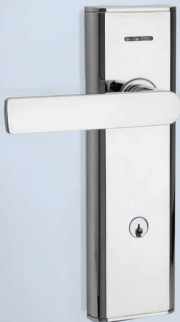
Vision Plate with Spire L3 Lever, Chrome Plate