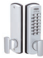
530DX Keyless Entrance Set