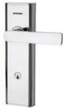
Keyless Entry Lockset