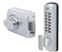
002DX Keyless Deadlatch