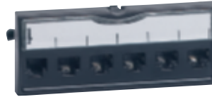
0 335 65