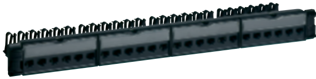
0 335 62