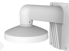
DS-1473ZJ-155 Wall Mount