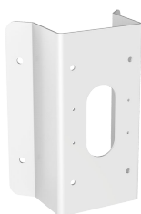
DS-1476ZJ-SUS Corner Mount