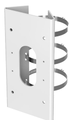
DS-1475ZJ-SUS Vertical Pole Mount