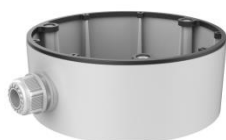
DS-1280ZJ-DM26 Junction box