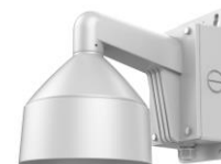
DS-1273ZJ-DM26-B Wall mount with junction box