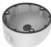
DS-1281ZJ-DM26 Inclined ceiling mount