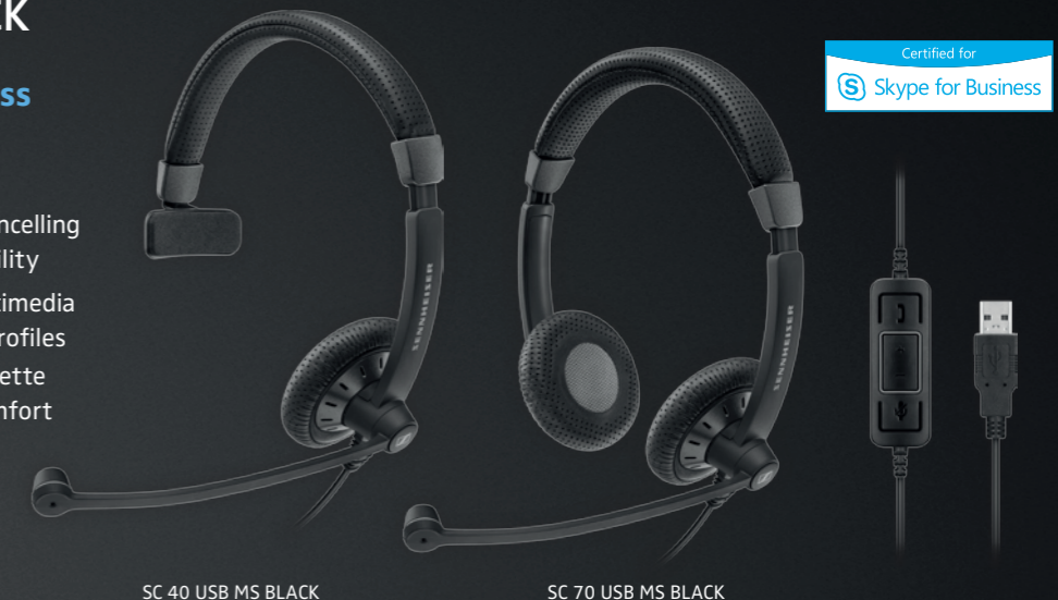
SC 40 USB MS BLACK