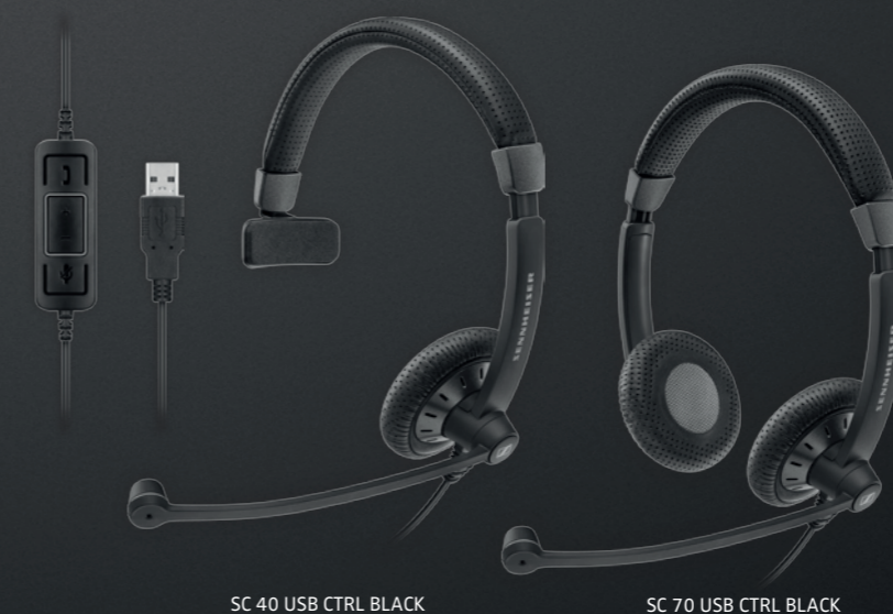
SC 40 USB CTRL BLACK