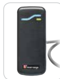
994720 SIFER Smart Card Reader