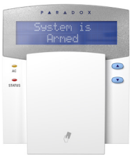
K641R - Front Closed