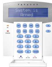
K641R - Front Open