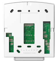
K641R - Back View