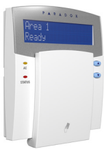
K641R - Angle View