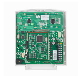
K641R - PCB