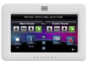
TM50 - Front View