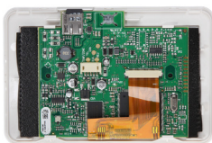
TM50 - Internal