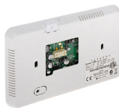
TM50 - Back View