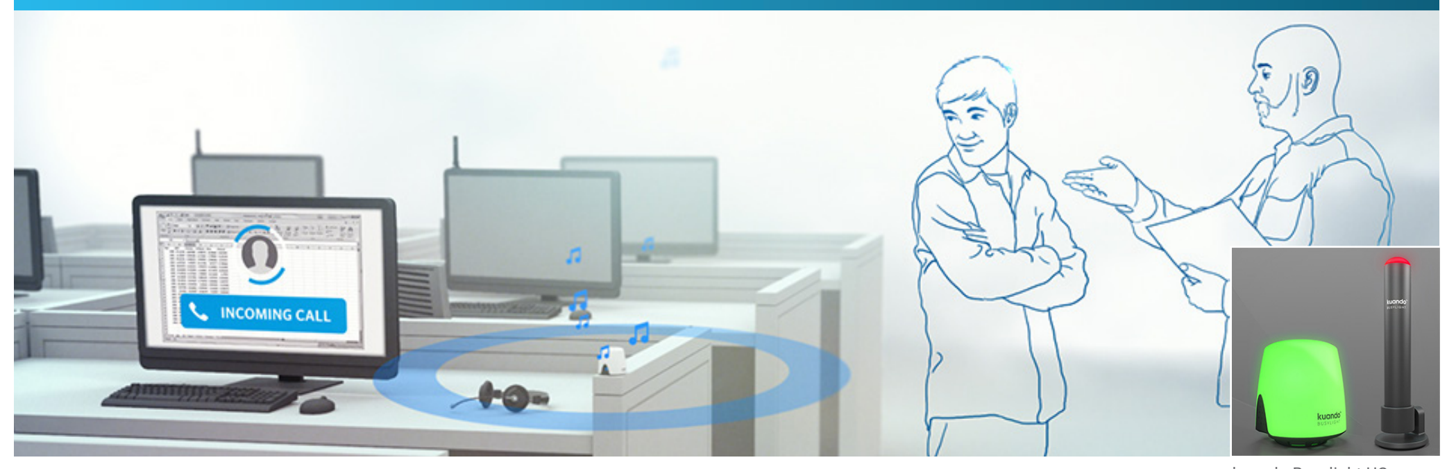
kuando Busylight UC.