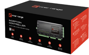
996300EX Inception Express Controller