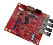
20503 Single Mode Fibre Modem