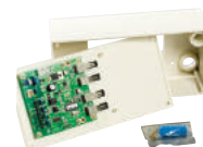
20502 Multimode Fibre Modem