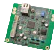
20500 LAN Over Ethernet Module