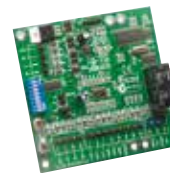
20322P 1 Door Access Module