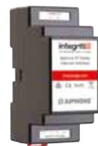
21305 Aiphone - Integrati Interface Module