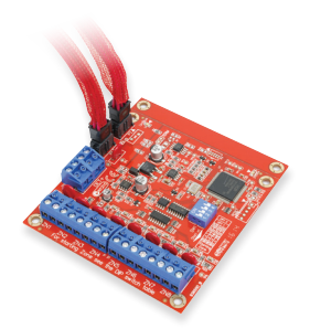
996500PCB&K Integriti UniBus 8 Zone Input Expander PCB & Accessories (Includes 270mm UniBus patch