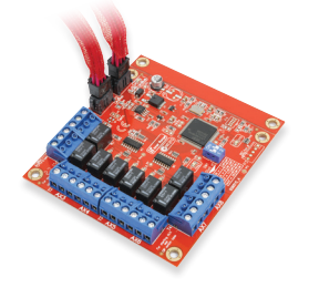
996515PCB&K Integriti UniBus 8 Relay Auxiliary Expander PCB & Accessories (Includes 270mm UniBus patch cable)