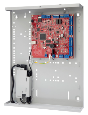
996001IPAUPS Integriti ISC in Medium Enclosure