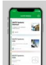
Digital Key Bluetooth LE NFC - Near Field Communication