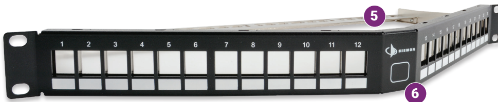
24-Port Angled Panel