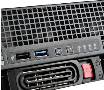
Power On / Off, system reset, USB 2.0 x 1, USB 3.1 Gen 1 Type-A x 1