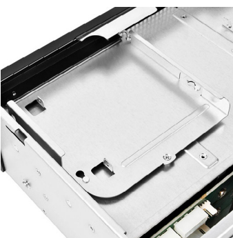
Slim ODD cage