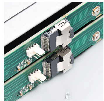
6 Gb/s Mini-SAS SFF-8087