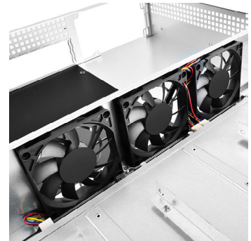
80mm x 15mm PWM fans x 3