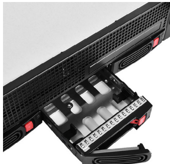
Supports four 2.5" / 3.5" SAS/SATA HDD / SSD