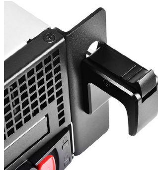
Auto lock handle for easily secures to rackmount cabinet without screws