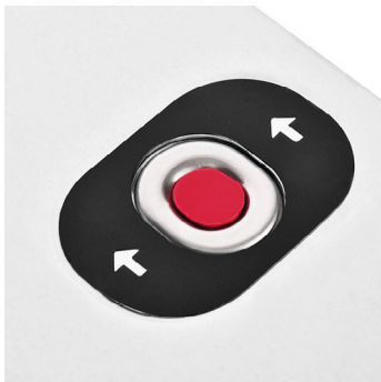
Button for releasing top cover