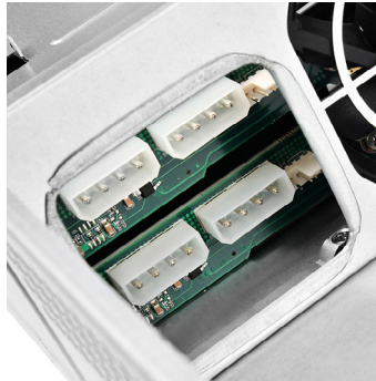
2 x 4-Pin peripheral connector