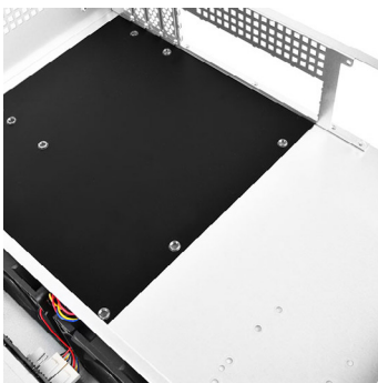
Supports Micro ATX motherboards