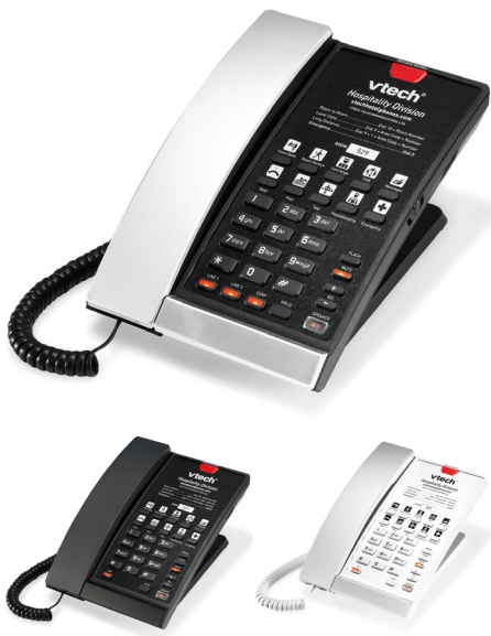
Analogue / SIP Corded Phone 1-Line A2210 / 1-Line S2210