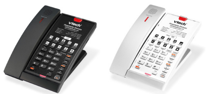
Analogue / SIP Cordless Phone 1-Line A2411 / 1-Line S2411