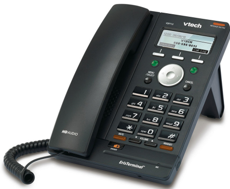
2-Line 2-Button SIP Deskphone VSP715A