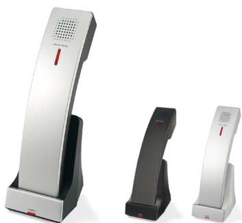
Analogue / SIP Petite Phone™ 1-Line A241HS / S241HS