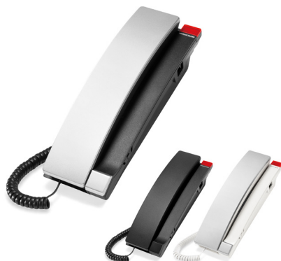
Analogue TrimStyle Phone 1-Line A2310