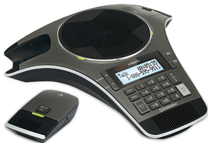
Analogue Conference Phone with 2x Wireless Mics VCS702A