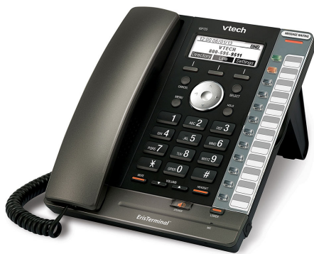
3-Line 24-Button SIP Deskphone VSP725A