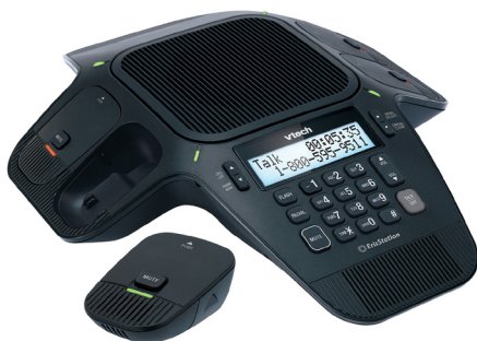
Analogue Conference Phone with 4x Wireless Mics VCS704A