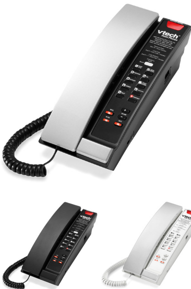
Analogue / SIP Petite Phone™ 1-Line A2211 / 1-Line S2211