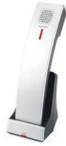
Additional Cordless Handset A241SDU