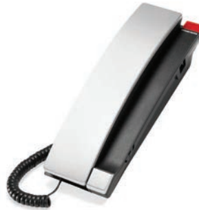
Corded TrimStyle A2310