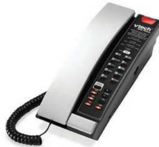
Corded Petite Phone® (non-speakerphone) S2211