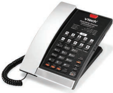
Corded Speakerphone A2210