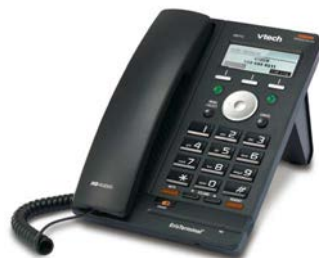
2-Line 2-Button SIP Deskphone VSP715A

SIP phones for your back office operation