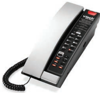
Corded Petite Phone® (non-speakerphone) A2211