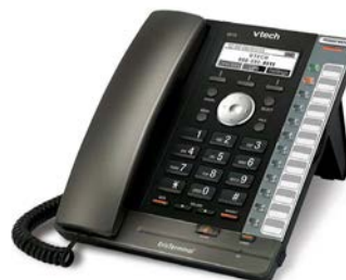
3-Line 24-Button SIP Deskphone VSP725A