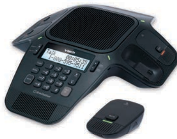
Analogue Conference Phone with 4x Wireless Mics VCS704A

Conference phone for your hotel meeting spaces