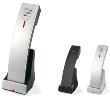
SIP Cordless Petite Phone™ S241SDU - 1 Line

Available in Matte Black, Silver Black and Silver Pearl