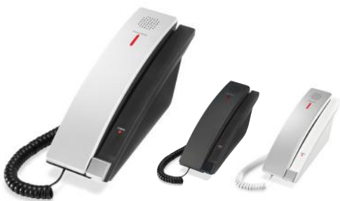
SIP Corded TrimStyle Phone™ S2310 - 1 Line

Available in Matte Black, Silver Black and Silver Pearl