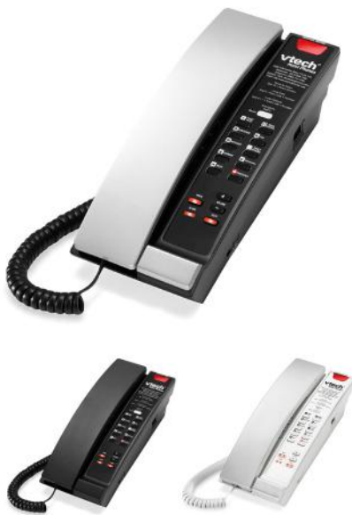
SIP Petite Phone™ S2211 - 1 Line

Available in Matte Black, Silver Black and Silver Pearl