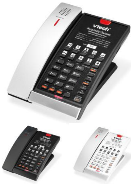
SIP Cordless Phone S2211 - 1 Line