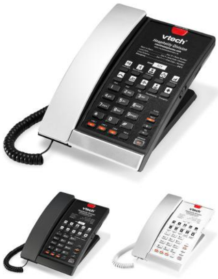
SIP Corded Phone S2210 - 1 Line