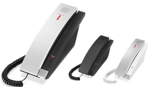
SIP Corded TrimStyle Phone™ S2310 - 1 Line

Available in Matte Black, Silver Black and Silver Pearl