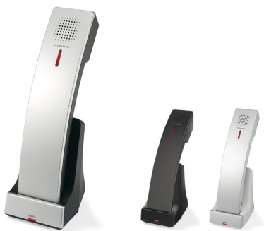
SIP Cordless Accessory Handset™ S241SDU - 1 Line

Available in Matte Black, Silver Black and Silver Pearl