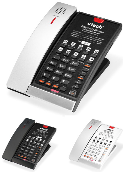
SIP Cordless Phone S2411 - 1 Line