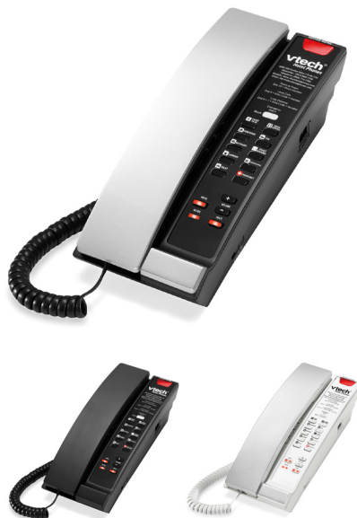
SIP Petite Phone™ S2211 - 1 Line

Available in Matte Black, Silver Black and Silver Pearl