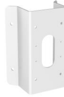
DS-1476ZJ-Y Corner Mount