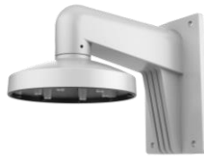
DS-1473ZJ-155-Y Wall Mount